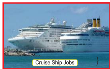
Cruise Ship Jobs