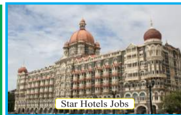
Star Hotels Jobs

Low Fees, Campus Interview Separate Hostel For Boys & Girls